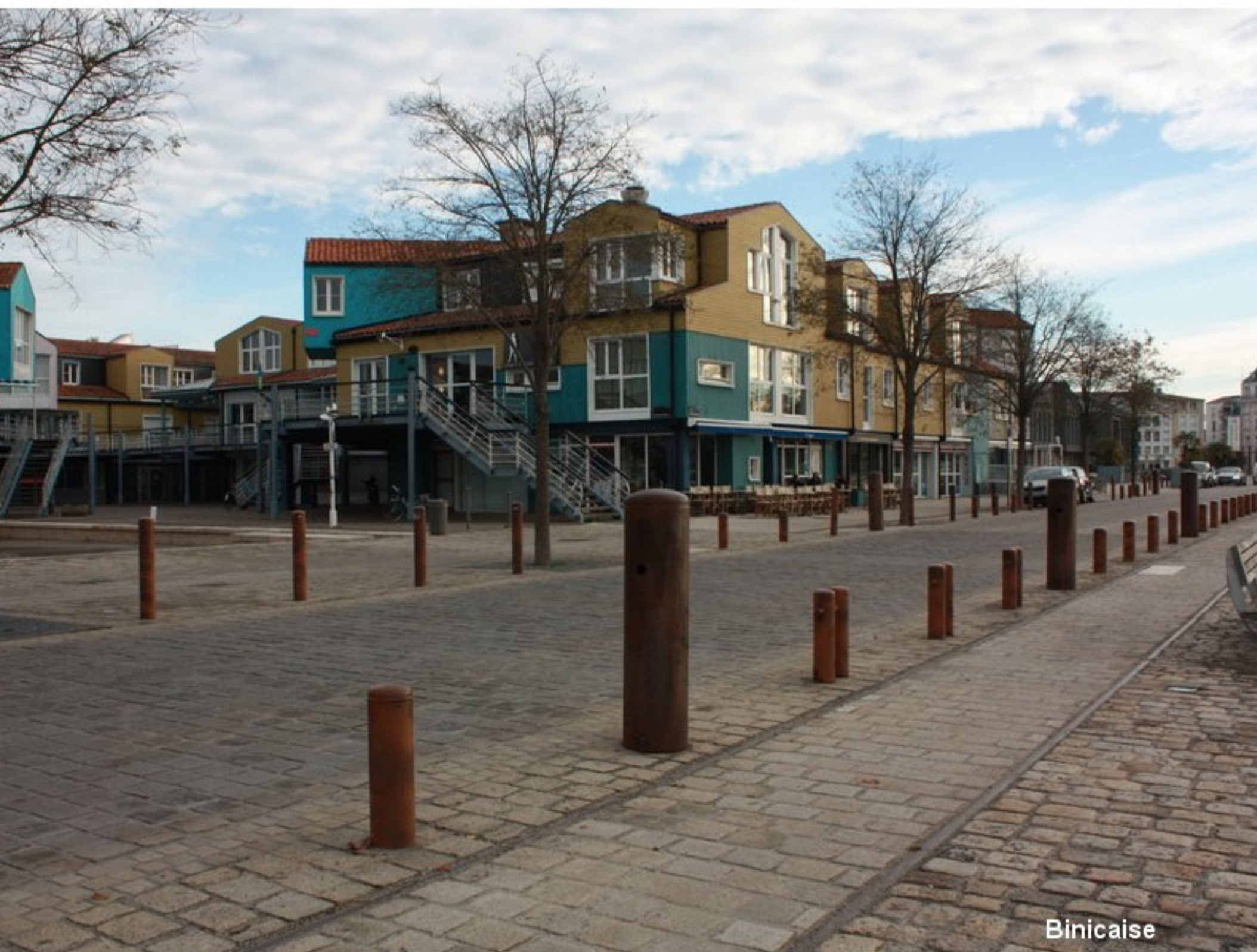
The Gabut district and its colorful wooden houses : the spirit of Scandinavia.

Script, text drawings & colors : Catherine Moreau and Alain Paillou